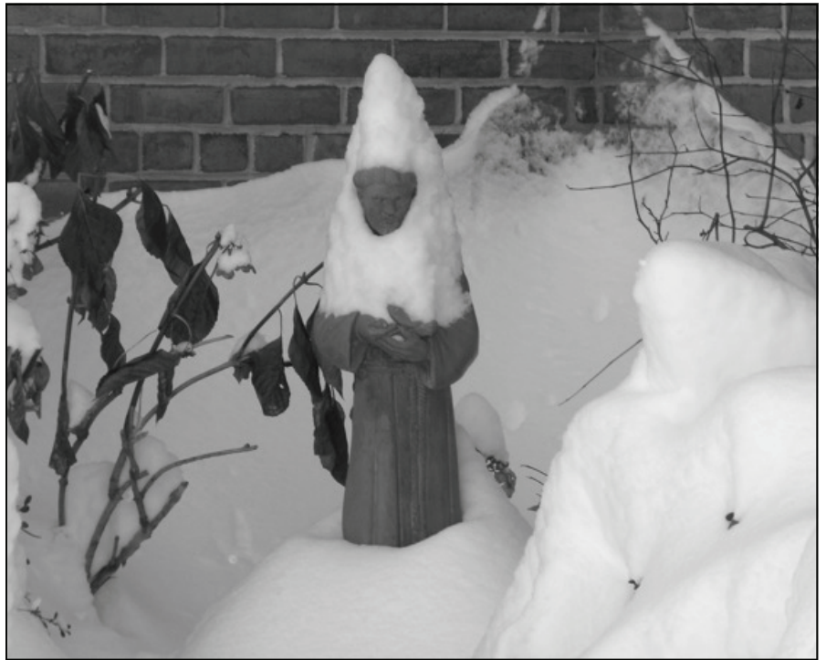
These photos were taken from the first snow in December... when it was still pretty and not such a mess!