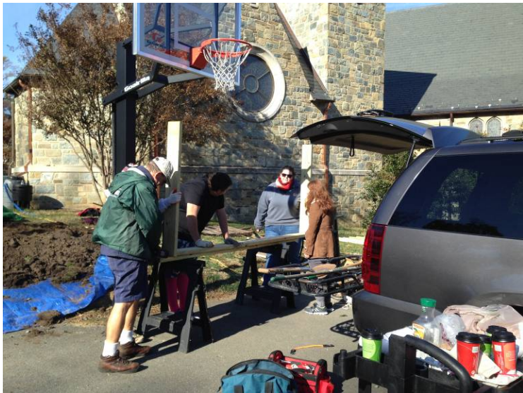
EYC works on the raised planter beds for the Food Pantry garden.

Four of the beds were refurbished to be smaller and more efficient size, and 5 new beds were built.